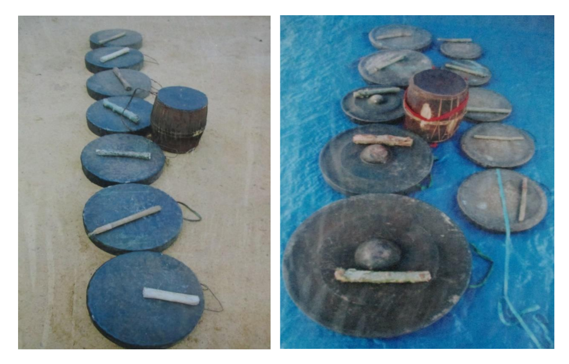
Figure 13: The set of chinh with 7 units + 1 drum; Figure 14: The set of chinh with 10 units + 1 drum.

Also, there are some suburbs such as X'râu hamlet. The Ba Nam (Ba To) community is located adjacent to the residence of Ba Na (Kriêm group) in two communities called An Toàn and An Nghĩa, situated in An Lão district, Bình Định province. Here, in addition to the traditional 3 units chinh, the H're people also performed the five units chinh along with a dance team made of girls in beautiful embellished costumes.