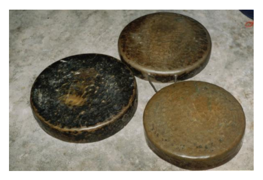
FIGURE 9: H'rê people's set of chinh.

In the middle of Minh Long, there is the Long Mai community, which lives very close to the district centre. As in Ba Thành (or Ba To), people at this place may try to represent the music of the Minh Long region. There are found H'rê musical assets that are not easily to find in other regions, such as singing during worshiping Cham Voray , or singing Dam Hoa . The H'rê people in the "Rvá" are very passionate about theirs pênhpút (made from two neohouzeaua, a specific type of bamboo).