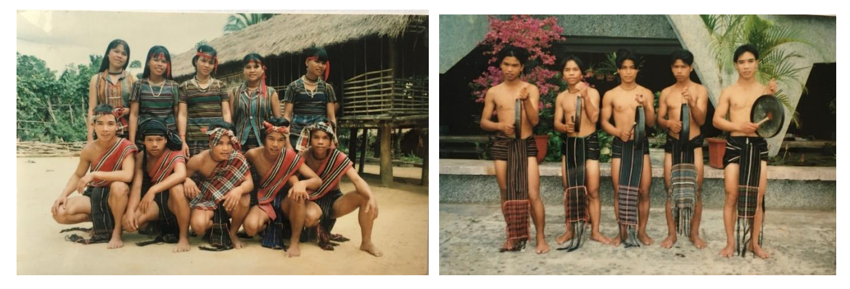
FIGURE 15: Chinh dance team at X'râu hamlet, Ba Nam commune; Figure 16: 5 units chinh team at X'râu hamlet, Ba Nam commune.

Also, there are some suburbs such as X'râu hamlet. The Ba Nam (Ba To) community is located adjacent to the residence of Ba Na (Kriêm group) in two communities called An Toàn and An Nghĩa, situated in An Lão district, Bình Định province. Here, in addition to the traditional 3 units chinh, the H're people also performed the five units chinh along with a dance team made of girls in beautiful embellished costumes.