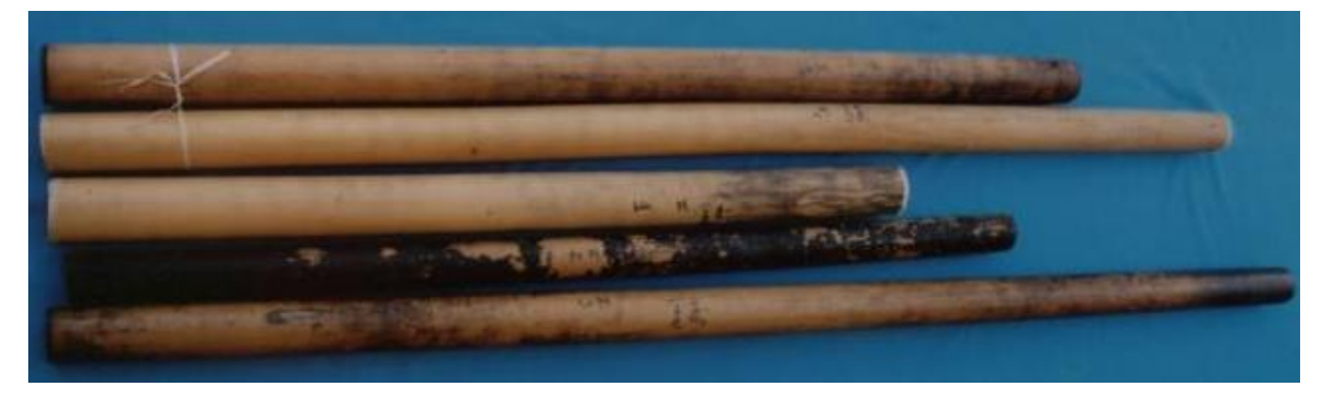
FIGURE 12: H'rê people's akhung (photo by the author).

FIGURE 10: Artist Đinh Ngọc Su playing tàvố; Figure 11: Tàvố made of soil (photos by the author).