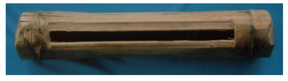
FIGURE 8: H'rê people's chinh k'la.